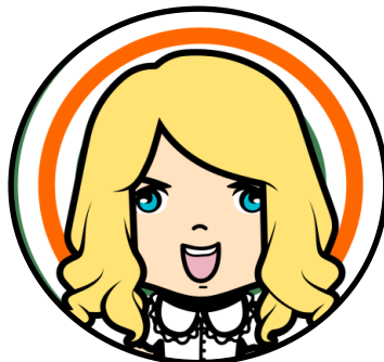
THE SPECTACULAR BETSY GOTTA